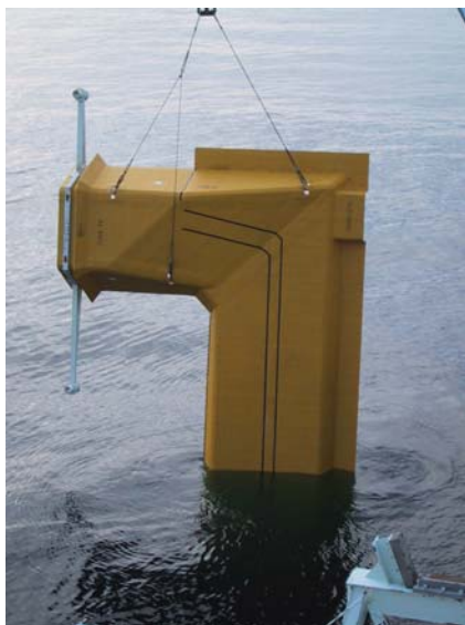
The other piece during installation